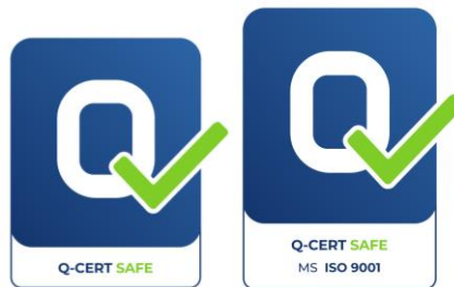
Vertical certification mark.

The basic design of the Q-CERT certification mark consists of a squared frame in which the logo is embedded. The Q-CERT logo is comprised of the letter Q in which the diagonal line is represented by a checkmark.